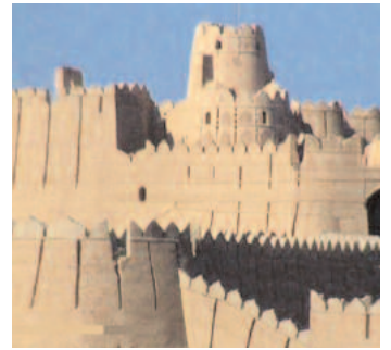
Raza Talpur, son of the former sovereign, stopped the repair.

levels: from the battlement on top and from within the wall. The fort was built at a time when cannons had become common and its design and position reveals that. It includes a multitude of stations for cannons and, because it is positioned high on a narrow ridge, enemy cannons would have had to fire at a great distance, permitting little accuracy. Cannonballs could either hit the hill or perimeter or would simply fly over the fort and fall on the enemies' own forces on the other side.