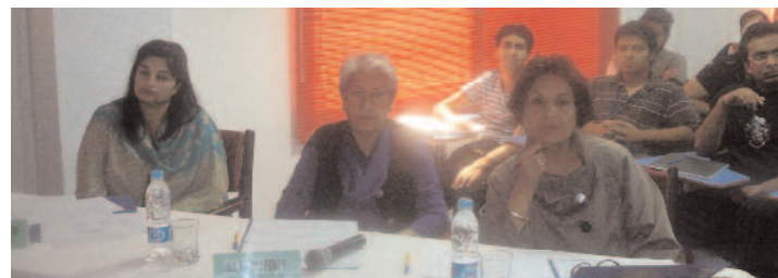
- Contd. on P/11

Consequently after all speeches concluded the participants were on