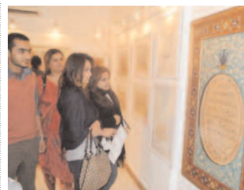
oil on canvas, and wood.

The students of Greenwich University visited a calligraphic art exhibition, where they interact-