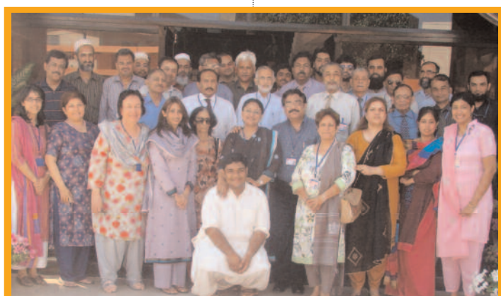
Group picture of the staff and Faculty of Greenwich University after lunch which was arranged to celebrate the achievement of our Vice-Chancellor on being awarded Tamgha-e-Imtiaz by the Government of Pakistan on March 23, 2010 for her achievements in Education and Public Service

The resulting class assignment from the individuals who interacted with this unique collection was spirited in itself. ■