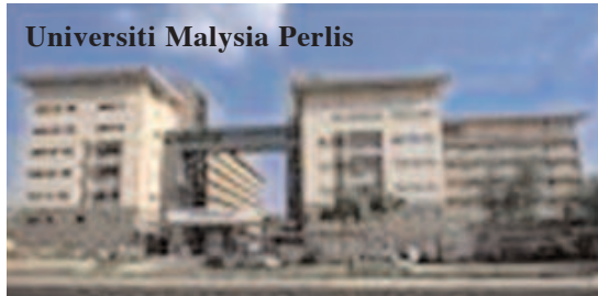
Universiti Malaysia Perlis

Malaysia namely Universiti Malaysia Perlis and Limkokwing University in February, 2010. The objective of the collaboration is to strengthen, promote and develop cooperation with Malaysia, a country in our neighbourhood which has emerged as an economic leader in Asia by setting high standards in education.