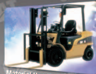
Material Handling Equipment