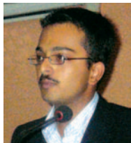
— Contd. on P/18

In explaining the media industry, he highlighted the importance of ethics in covering news, responsibilities of a