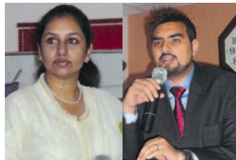
emphasis of the Road Show for Career Awareness.