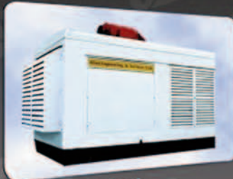
Generator on Rent