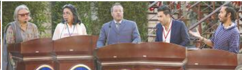
Dignitaries of the evening