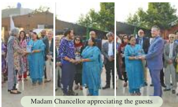
Madam Chancellor appreciating the guests