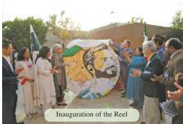
Inauguration of the Reel