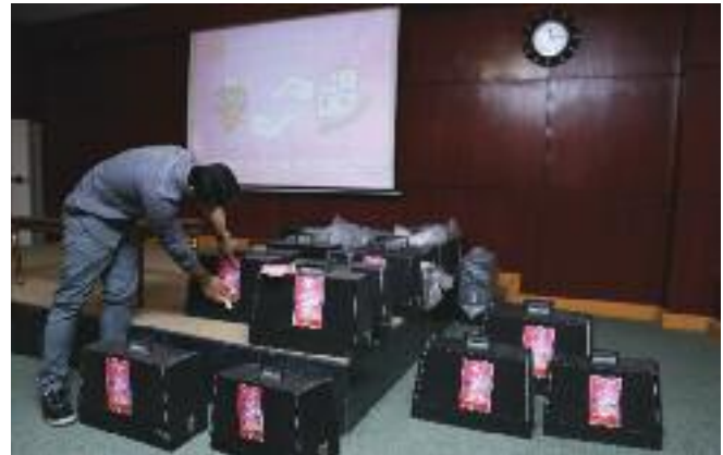
The Student Development Council (SDC) organized a CSR Activity in collaboration with "Nighat Welfare Trust" on August 25, 2017 where by 45 Sewing Machines were Distributed among widow and needy women.