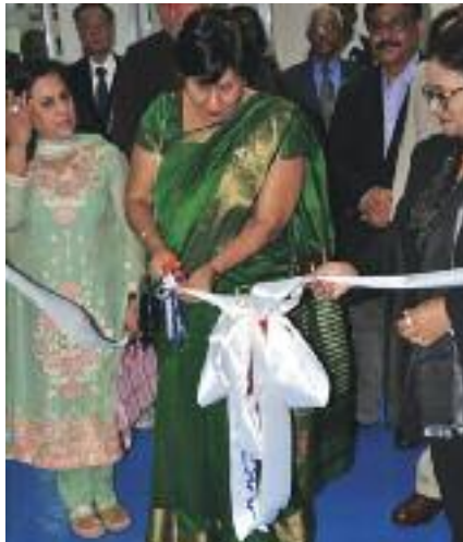
Hon (Mrs) Leela Devi Dookum Luchoomun, Minister of Education and Human Resources, Tertiary Education & Scientific Research, launching International Language Centre

G reenwich University Pakistan Mauritius Branch Campus organized its 2nd Orientation 2017 and launching of International Language Centre Ceremony on November 13, 2017 at the Campus. Hon (Mrs) Leela Devi Dookum – Luchoomun , Minister of Education and Human Resources, Tertiary Education & Scientific Research graced the occasion as the Chief Guest.