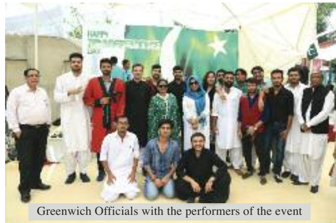
Greenwich Officials with the performers of the event