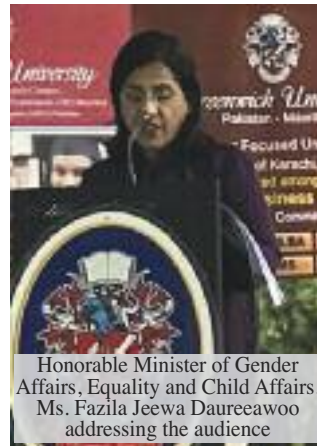
Honorable Minister of Gender Affairs, Equality and Child Affairs, Ms. Fazila Jeewa Daureeawoo addressing the audience