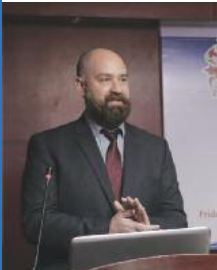
Cultural Attache, U.S. Consulate Karachi

It was an interactive workshop which was thoroughly enjoyed by the participants. The workshop ended by presenting shield to the Guest Speaker. ■