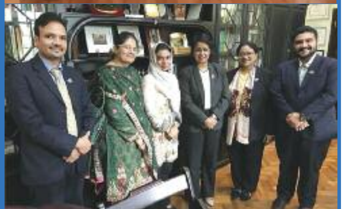
Greenwich University's faculty and students attended the Presidential Lecture on Block Chain Technology at the State House, Mauritius on November 17, 2017.