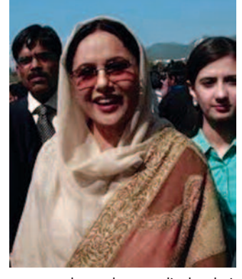
women who are keen to display their products, including cosmetics, dresses, embroidery and others

He said the HCCl, in association with two private firms, was holding the exhibition from July 7-9. This programme is being organized for the first time in the history of Hyderabad, where 40 stalls will be given free of cost to deserving