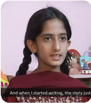
And when I started writing, the story just