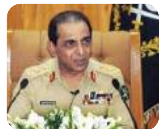
prosperity in the region.

Talking to elders of Tharkani and Uthmankhel tribes during a visit to Bajaur Agency on Friday, he said peace is necessary for development and