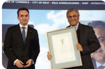
Muhammad Yunus and Professor Michael A. Spence.

The jury for the 2013 edition of the award comprised Nobel Laureates Professor