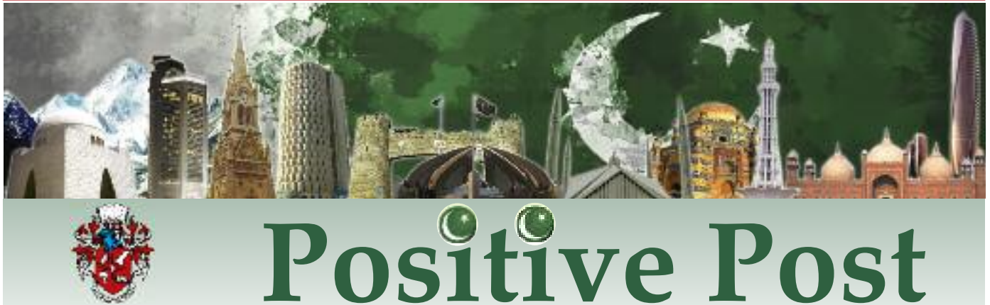
Greenvich University www.greenwichuniversity.edu.pk