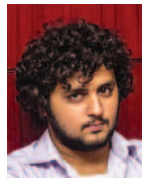
Adeel Qureshi BS413635

A 60 inches long leatherback turtle that accidentally got entangled in fishing net in Gwadar was successfully released back into the deep sea.