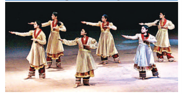
The Lahore Arts Council (LAC) took measures to turn classes into diploma and degree courses.

The LAC took measures on the syllabus of Alhamra Academy of Performing Arts and faculty hiring on Wednesday.