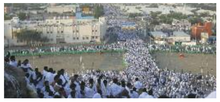
A team from Saudi Arabia arrived in Islamabad on Monday to begin the process for the provision of immigration facilities to Pakistani pilgrims under the Road to Makkah project, Radio Pakistan reported.

Under the Road to Makkah project initiated by Saudi Arabia, all immigration requirements are fulfilled at the airport of origin. The project also includes other Muslim countries, such as Indonesia and Malaysia.