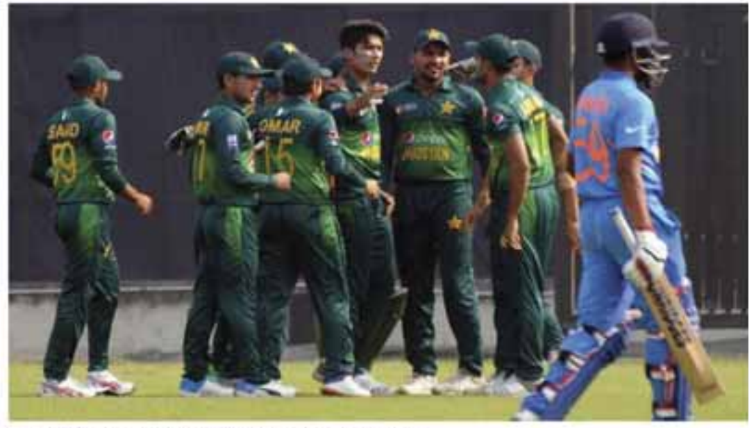
Pakistan restricted India to 264 for eight in 50 overs.

Pakistan on November 20 qualified for the final of ACC Emerging Teams Asia Cup 2019 after beating India by three runs in the first semi final in Dhaka.