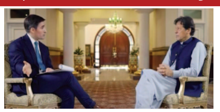
interviewer interrupts the prime minister to reconfirm his words asking, "Seriously?"

Surprised over his clear-cut response of "absolutely not", the