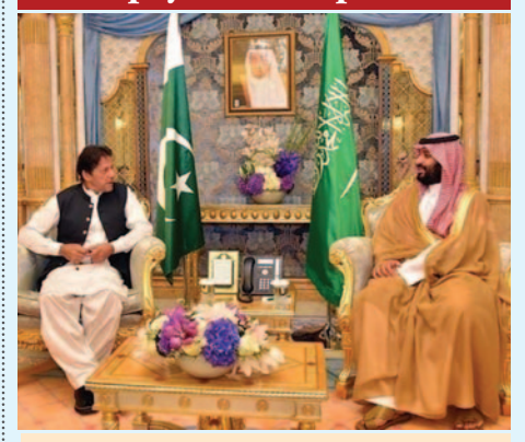
Saudi Arabia will give Pakistan oil worth $1.5 billion on deferred payment in July, the Financial Times reported.

Friction between the two countries increased last year after Pakistan's foreign minister criticized Saudi Arabia over its silence on India's revocation of Kashmir's special status.