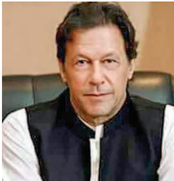
business-friendly IT policy, the Prime Minister encouraged Microsoft to further expand its footprint in Pakistan.

While alluding to Pakistan's potential in the Information Technology (IT) sector and the Government's