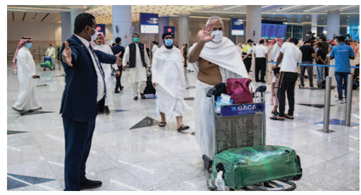
Pakistan. Over 2 million. Well done everyone!."