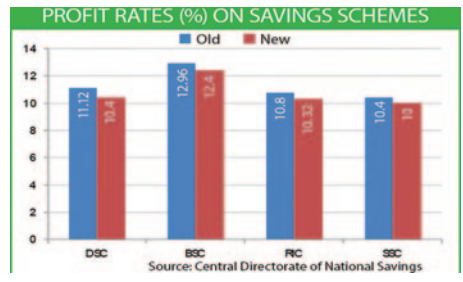
Issue 57, Issue 63 and Issue 58, respectively, along with the revised rates before issuance.

The CDNS has dispatched the revised rate sheets to all regional offices with instructions that the existing stock of blank special savings, regular income and defence savings certificates would now be used by affixing rubber stamps with