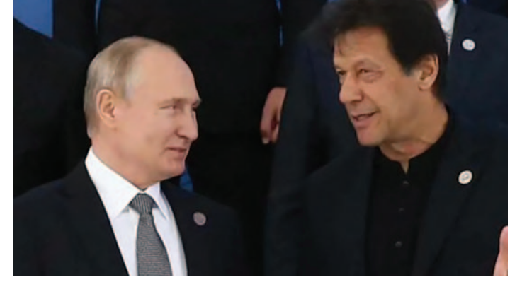
with Russian backing in 2017.

The two developments that in particular supported this rapprochement were the signing of a bilateral defence cooperation agreement in 2014 and Pakistan's inclusion in the Shanghai Cooperation Organisation