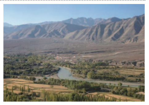
Indus Waters Treaty (IWT) in its true spirit.

In March, both India and Pakistan had agreed and reiterated their commitment to implement the