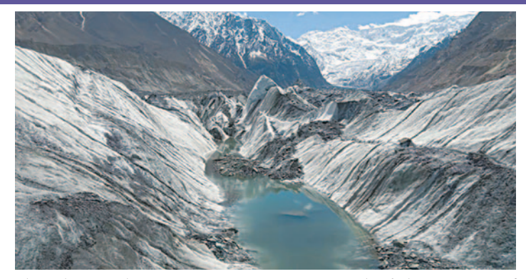
when glacier melting starts.

According to the GBDMA assessment, the possible lake burst could submerge a portion of Karakoram Highway, a bridge, over 37 houses in Hassanabad, two powerhouses, a Frontier Works Organisation camp office and vast fertile lands. It may also block the flow of Hunza River, triggering an Attabad-like disaster. The water discharge from the dammed lake increases in summer