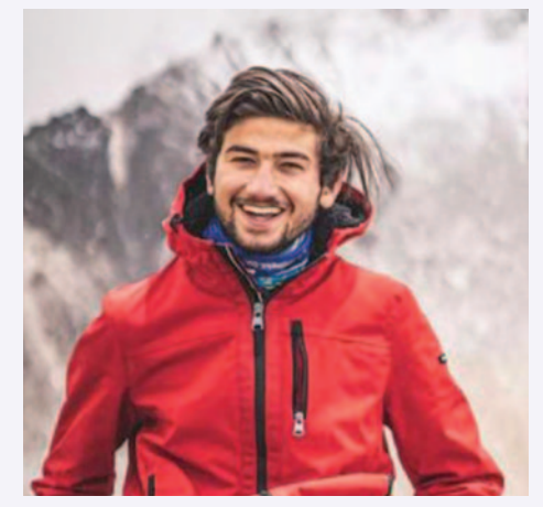
(8,047m) earning the title 'The Broad Boy' and reached the peak of Khusar Gang-Alpine Style (6,050m) at 18 years of age.

At 17 years of age, he climbed Broad peak